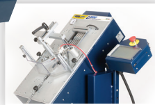
Easy Tilt Adjustment