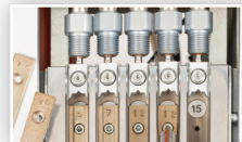
Changeable V-Channel Inserts