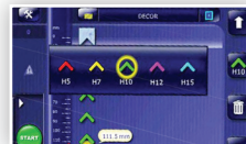
Touch Screen P.C. Memory Programming